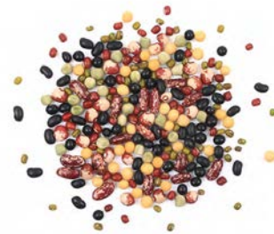
Dry beans as an ingredient