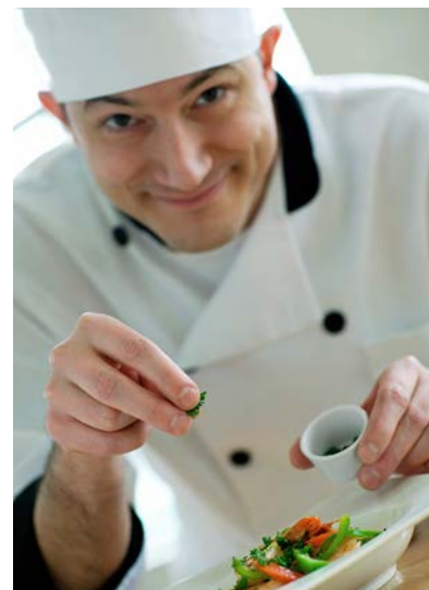
Chefs make the healthy choice