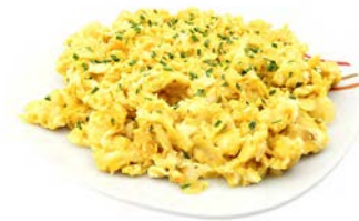
Scrambled eggs with herbs