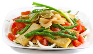
Tofu stir fry