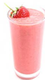
Non-dairy fruit smoothie