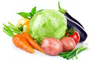
More fruits and vegetables