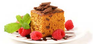
Desserts in smaller portions