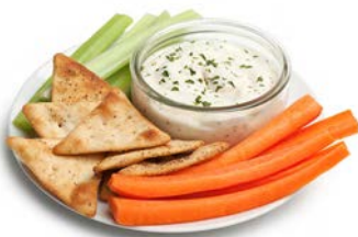
Healthy veggie snack