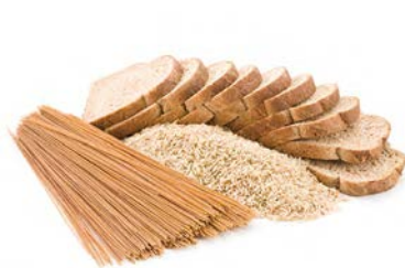
More whole grains