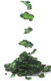
Baked kale chips as a snack