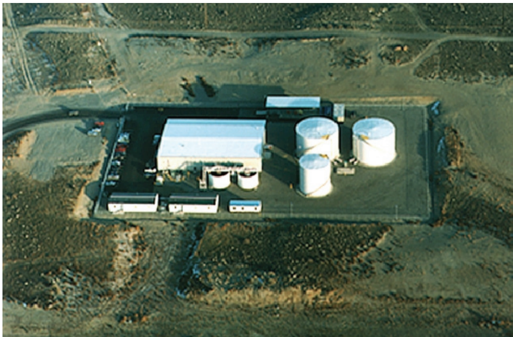
Liquid Treatment Facilities - 300 TEDF

The 300 Area TEDF, operated by Fluor Hanford Company, is located on the northernmost boundary of the 300 Area, adjacent to the Columbia River. The TEDF collects process waste water which is discharged to the 300 Area Process Sewer from approximately thirty office buildings, research laboratories, and support facilities in the 300 Area. Some waste water of this type is also brought to the TEDF from other areas of the site. The facility removes metals and organic contaminants before the purified water is discharged to the Columbia River. Heavy metals with radioactive isotopes are also removed in the metals removal process. The process waste water stream consists primarily of potable water, equipment cooling water, steam condensate, and laboratory and research waste water. The mean daily flow rate is currently in the range of 35 to 150 gallons per minute, with maximum spikes attaining 600 gallons per minute.